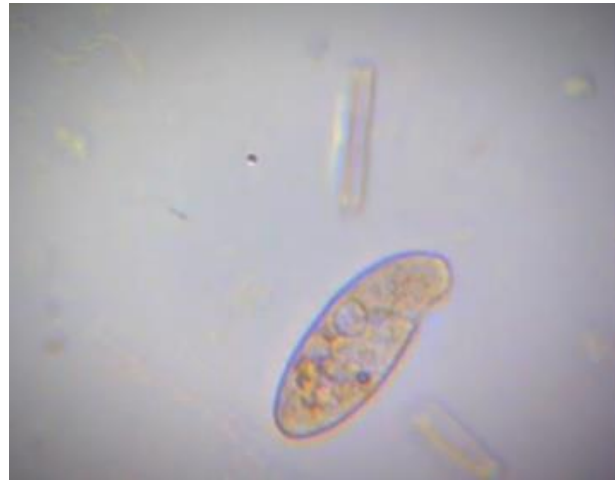
Figure 1. The Picture of Tetrahymena sp under the microscope with enlarge 40 x 10

Ichthyophthirius multifiliis ectoparasite was also found in the mucus of fish with white spots marked on the surface of the skin, gills, and fins. Kordi (2004) stated that Ichthyophthirius multifiliis makes fish reluctant to swim. The disease is called Ichthyophthiriasis characterized by white spots and Ich. Ich is an obligate parasite that is broadly found in every part of the world and it attacks all types of freshwater fish around the world. If Ichthyophthirius multifiliis attacks the gills, the gills will be damaged, hampering the process of gas exchange (oxygen, carbon dioxide, and ammonia).